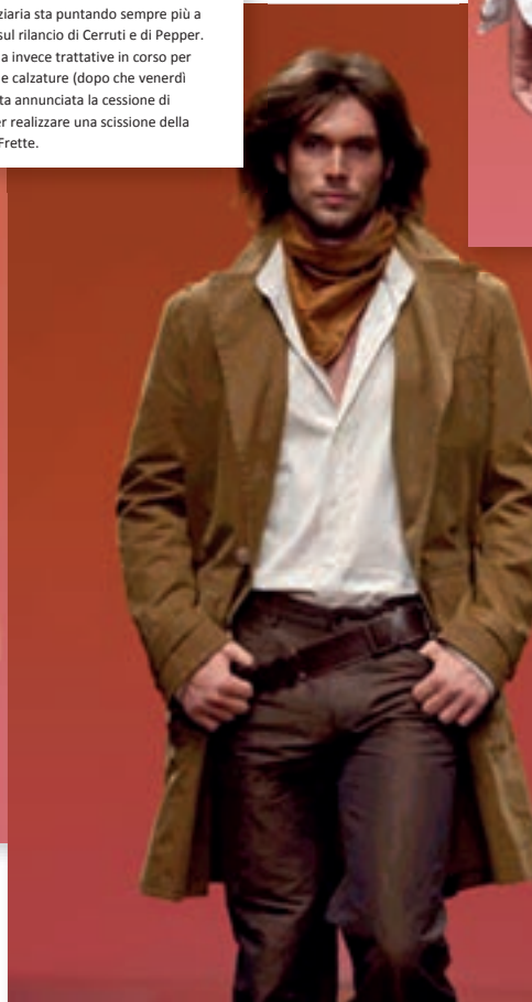
Cowboys ride again in a bad world