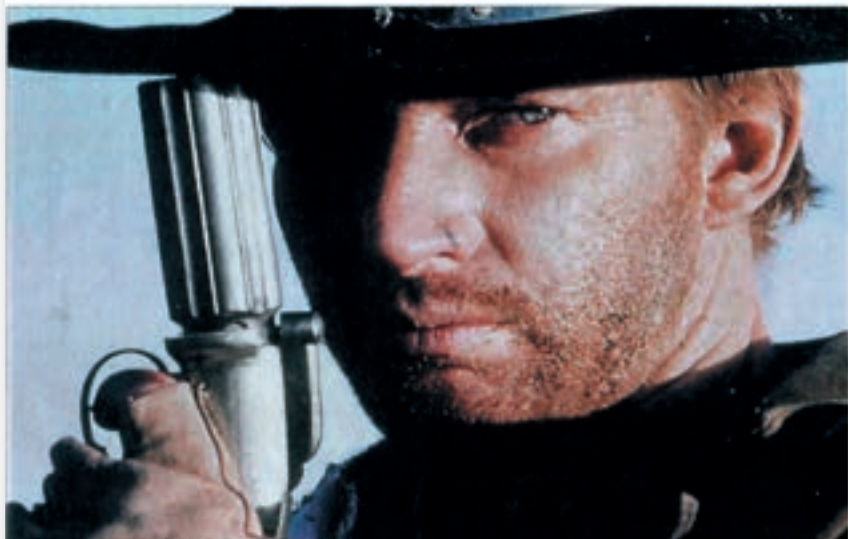
Hier Gewalt ist ... David Wenham in Milcho Manchevski's Mazedonien-Eposen „Dust“