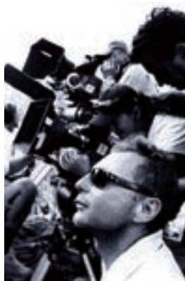
Milcho Manchevski has to date written and directed two feature films: Before the Rain (1994), which won thirty awards at international festivals, including Best Film in Venice, Independent Spirit, an Oscar