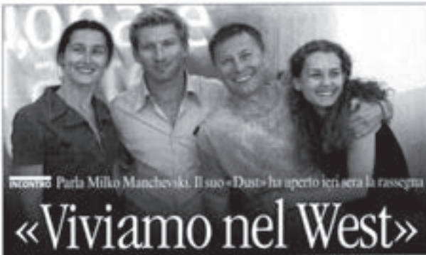
Intervista Parla Milko Manchevski. Il suo «Dust» ha aperto ieri sera la rassegna

S uoi studi cinematografici sono stati da sempre, fino al recente fallimento, un punto di riferimento per i giovani. Il regista di «La Nato» è stato il primo a fare il regista. E ora, dopo il fallimento, si è dato un'occhiata indietro e si è detto: «La Nato ha fallito ma ora dobbiamo avere fiducia». Il regista di «La Nato» è stato il primo a fare il regista. E ora, dopo il fallimento, si è dato un'occhiata indietro e si è detto: «La Nato ha fallito ma ora dobbiamo avere fiducia».