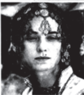
Indonesian Ministry of Education and Culture, 1994). The curriculum is a