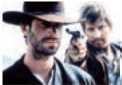
Una scena del film.

La storia di Dust si articola su due piani temporali. New York, oggi. Un ladro ricattato da poliziotti corrotti ascolta il racconto di un'anziana signora, Angela, che nasconde un tesoro e si dichiara pronta a consegnarglielo in cambio della sua attenzione. Il Far West americano, cent'anni fa. Attraverso la narrazione della vecchia seguiamo le avventure di due fratelli perdutamente innamorati della stessa donna, Lilith. Luke il maggiore (David Wenham), fugge in Europa e finisce in Macedonia dove partecipa da mercenario alle sanguinose lotte per bande tra macedoni e turchi. Ci arriva anche Elijah (Ralph Fiennes), deciso a riscrivere a modo proprio la storia di Caino e Abele.